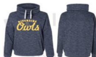
RIV09 - Navy Ladies RO Sweatshirt, Crew 60 Cotton/40 Poly Fleece, Pouch Pocket

SHOW YOUR RIVERSIDE PRIDE! SPIRIT WEAR IS IDEAL FOR BIRTHDAY & HOLIDAY GIFTS!