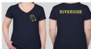
RIV07 - Navy Owl Ladies V-Neck Tee Gildan Ladies' Heavy Cotton 5.3 oz.