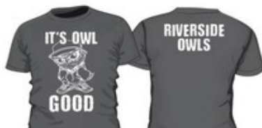
RIV08 - Gray Owl Good Tee, Short Sleeve