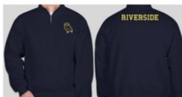
RIV05 - Navy Owl Sweatshirt, 1/4 Zip Jerzees 50/50, Cadet Collar