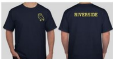
RIV01 - Navy Owl Tee, Short Sleeve Gildan Heavy Cotton 5.3 oz.

★★ SPIRIT WEAR CAN BE WORN ANY DAY OF THE WEEK WITH UNIFORM BOTTOMS! ★★