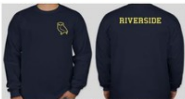
RIV03 - Navy Owl Tee, Long Sleeve Gildan Ultra Cotton 6 oz.