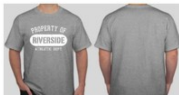
RIV02 - Gray Athletic Tee, Short Sleeve Gildan Heavy Cotton 5.3 oz.