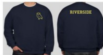
RIV04 - Navy Owl Sweatshirt, Crew Gildan Heavy 50/50 Blend 8 oz. Fleece